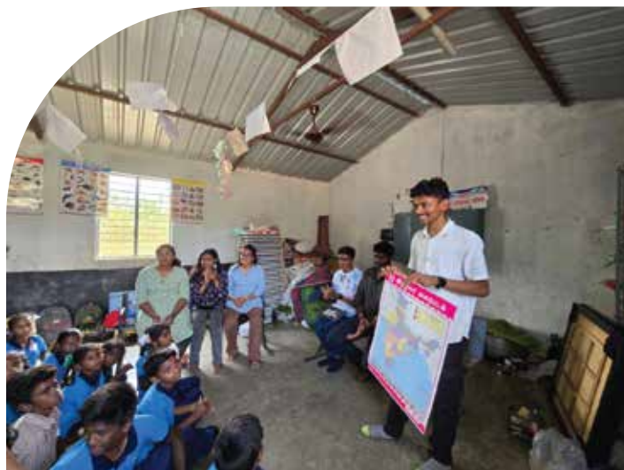
Visitors from UK