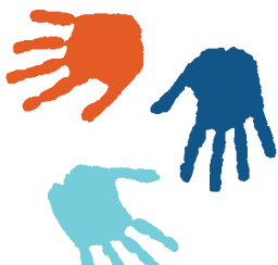
Director Seb's Projects India