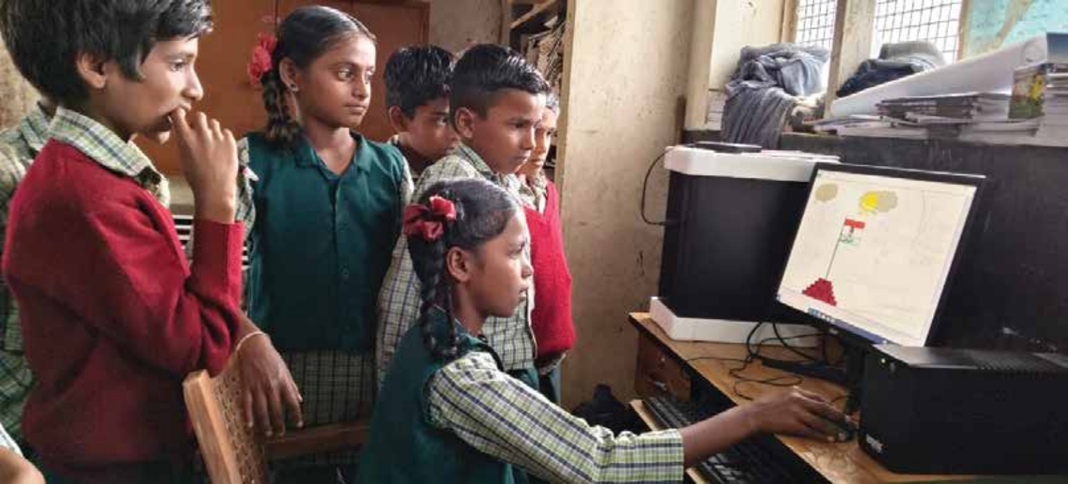
Volunteers from VIT